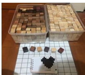
Wood, cubes, and building blocks