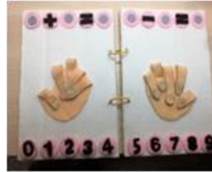
Learning to Count