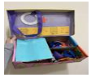
Practicing Addition and Subtraction