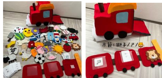
Zhuyin Fuhao (Bopomofo) Train