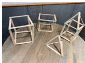
Building blocks of popsicle stick