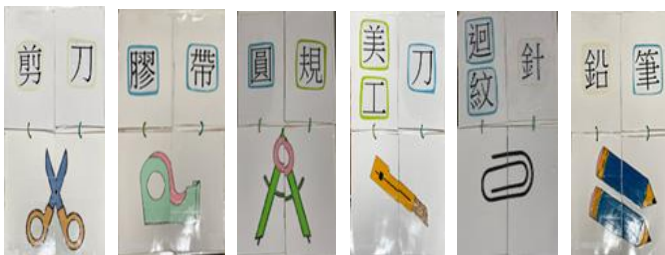
Flashcards of Stationery Name