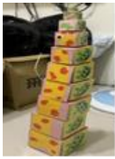
Understanding the Concepts of big, Medium, and Small