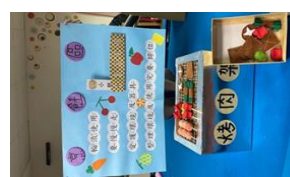
A set of Barbecue Grill