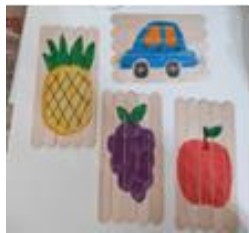
Understanding the Concepts of the Whole and the Parts