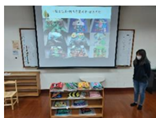
Demonstration of teaching aids