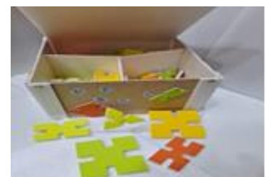
Building blocks of snowflake-shaped