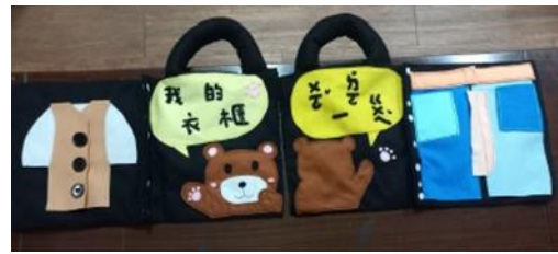
Tying shoelaces, zipping up zippers, and buttoning buttons