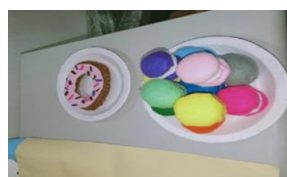
Doughnuts and Macarons