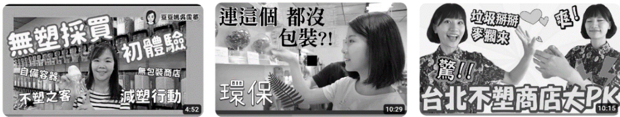
Fig. 1. Unboxing video shown in this study.